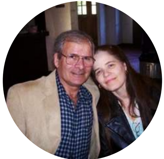
PAPOU & YIA YIA

ITALIAN BREAD COOKED W/ GARLIC BUTTER & LAYERED W/ MELTED CHEESE ADD TOMATO FOR $.50 | ADD BACON FOR $.65